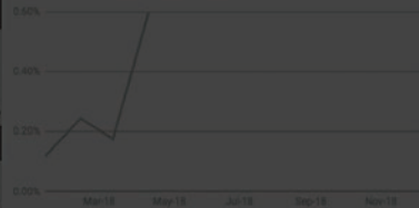
Lead to Customer Conversion Rate