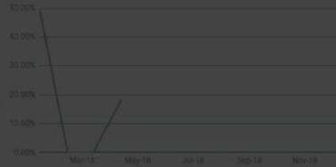
Visit to Customer Conversion Rate